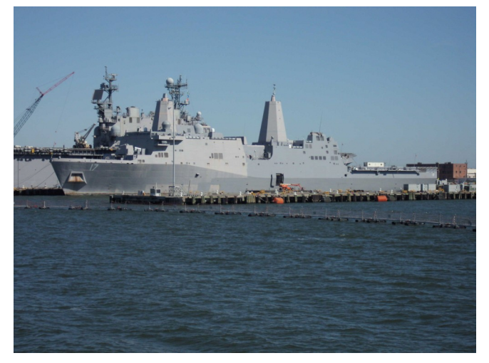
USS San Antonio, LPD 17, at Naval Station Norfolk