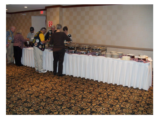
The start of the buffet line for dinner on Friday evening