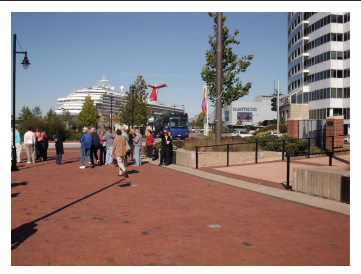
Walking to board the Spirit of Norfolk