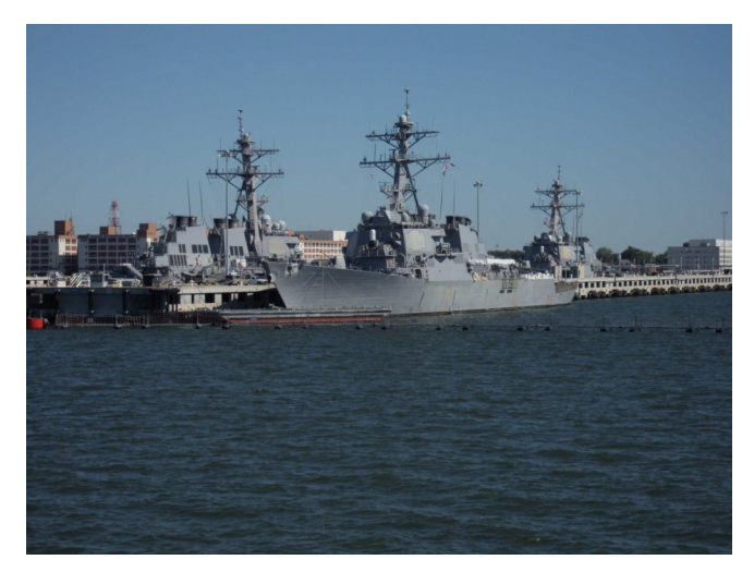
USS Mahan, DDG 72, at Naval Station Norfolk