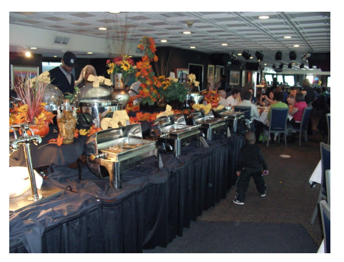
The buffet aboard the Spirit