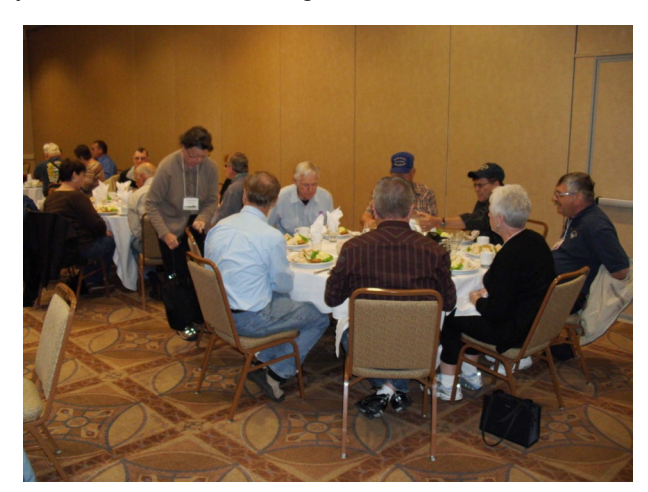
Lunch at the Vista Point Catering Center at Naval Station Norfolk