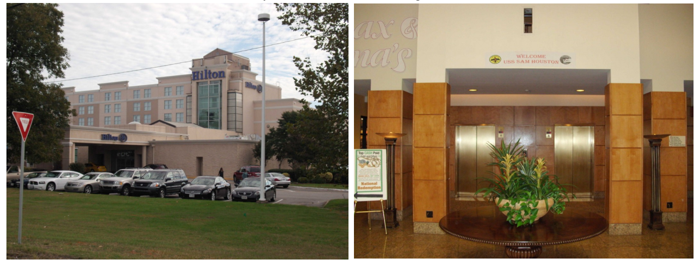
The host hotel

Pictures associated with the reunion follow. Many attendees contributed their photos.