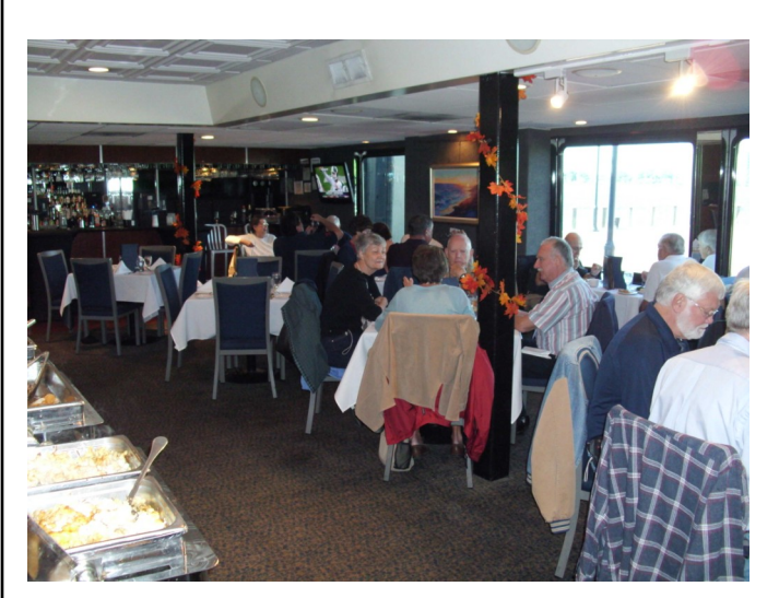
Dining aboard the Spirit