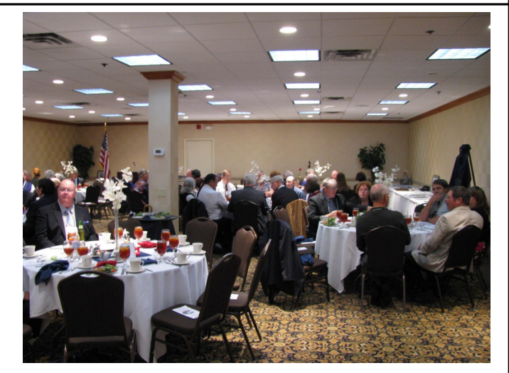
Attendees at Saturday night's banquet