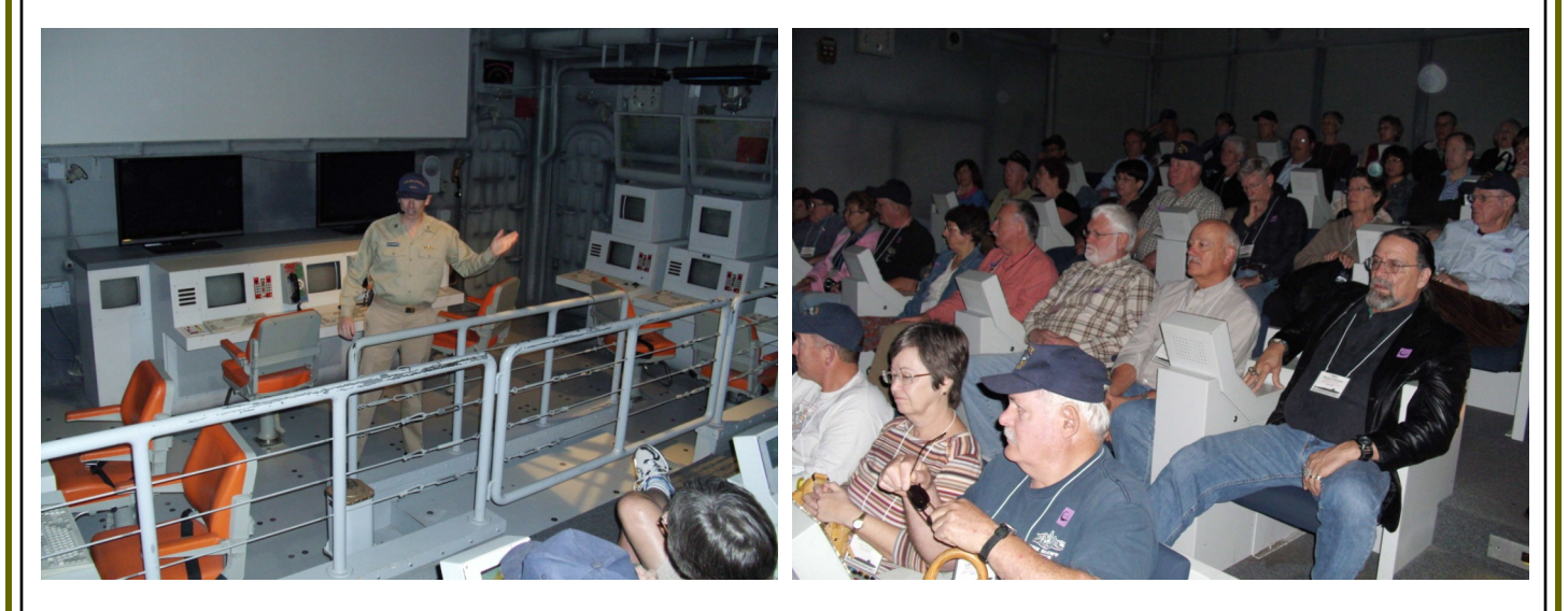
Aegis Interactive Theater (USS Aegis)