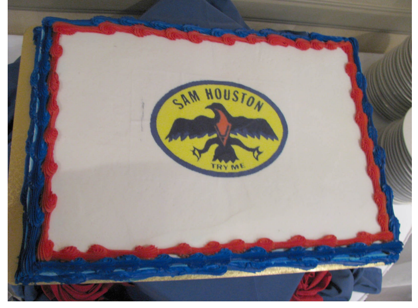
Dessert at the banquet